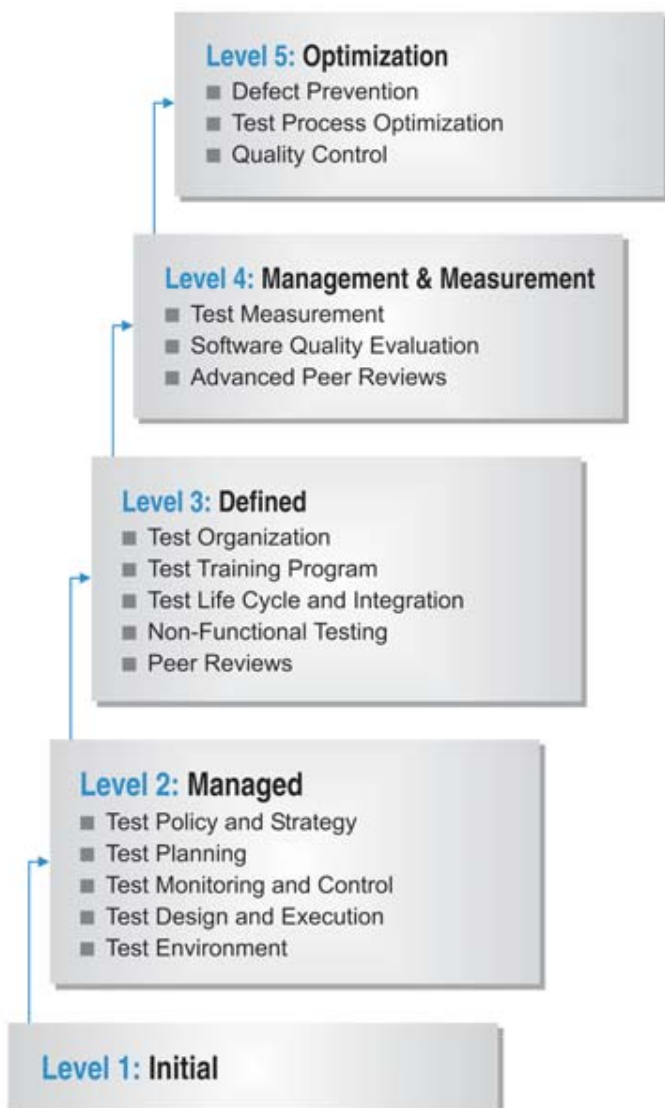
TMMi maturity levels and process areas